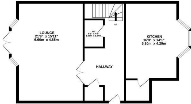
GROUND FLOOR 753 sq.ft. (69.9 sq.m.) approx.